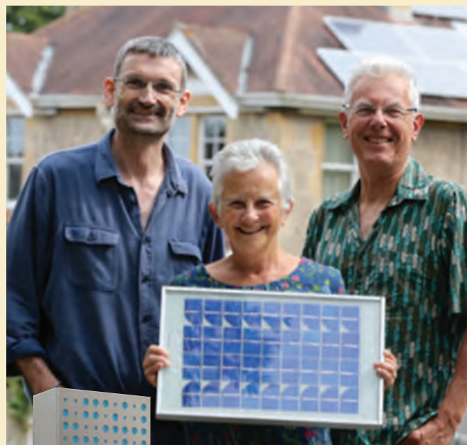
Domestic solar PV and batteries as part of the Solar Streets project