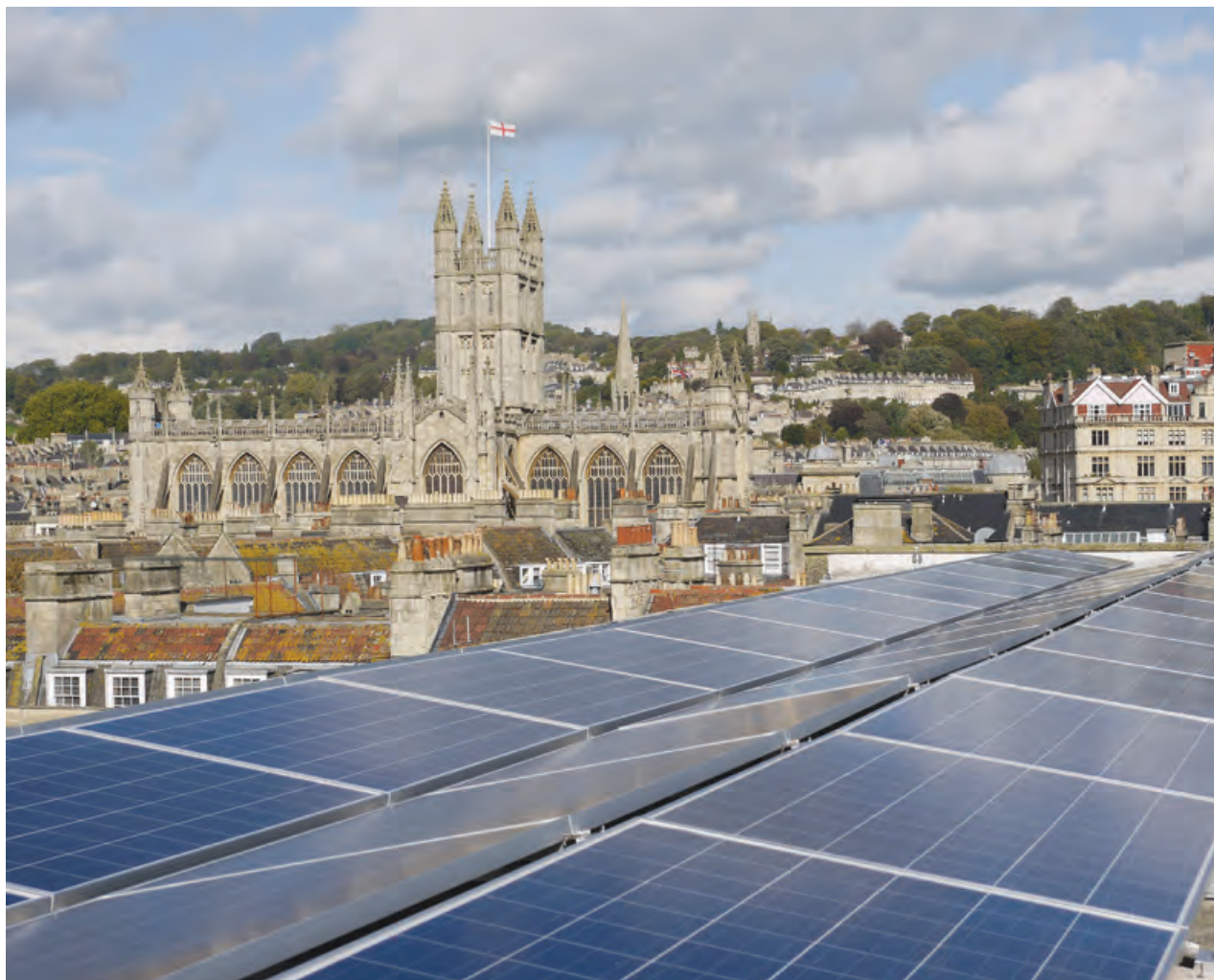
Community solar PV on B&NES Council offices, funded from our share offer in 2014

more information on the geographical scope of our area, see our Business Plan Overview available on our website www.bwce.coop under Resources/BWCE Documents.