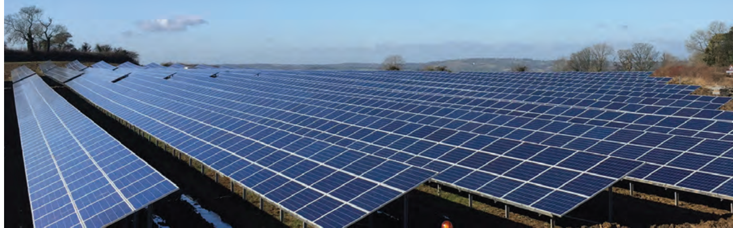
The Wilmington Solar Array near Marksbury in Bath & North East Somerset

We are committed to community energy and the power it has to bring people together to address climate change, whilst also generating significant local community and economic value