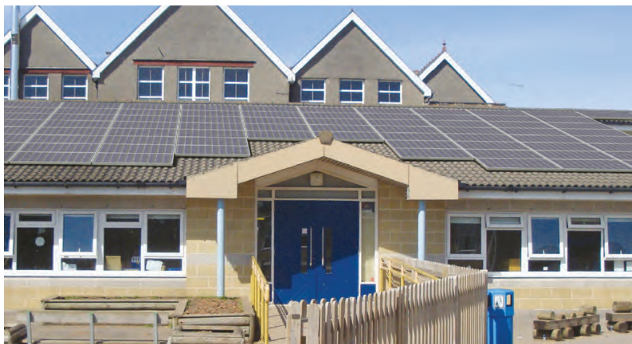
Community solar PV on Peasedown St John Primary School, funded from our first share offer in 2011