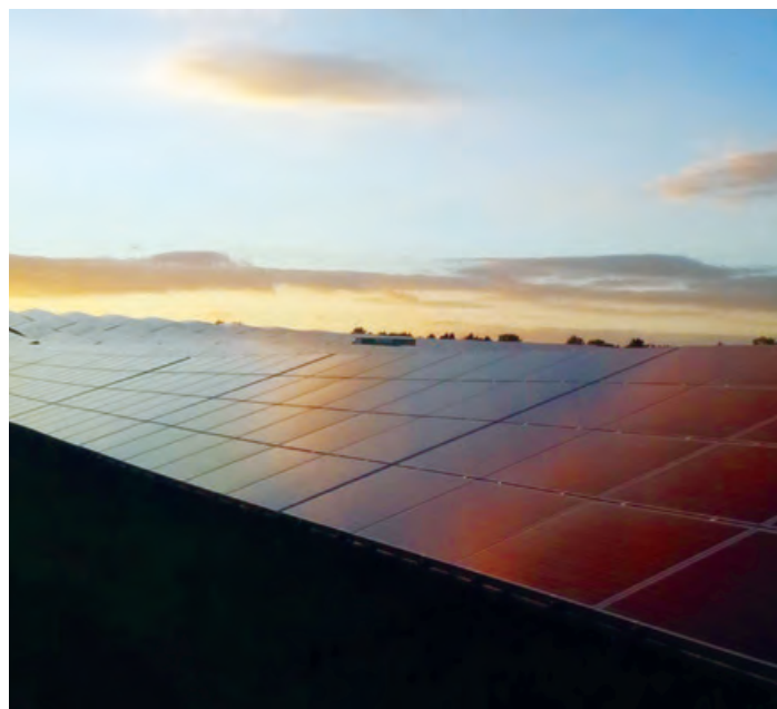
The solar energy array near Crewkerne

You can view our privacy policy on our website at www.bwce.coop/privacy .